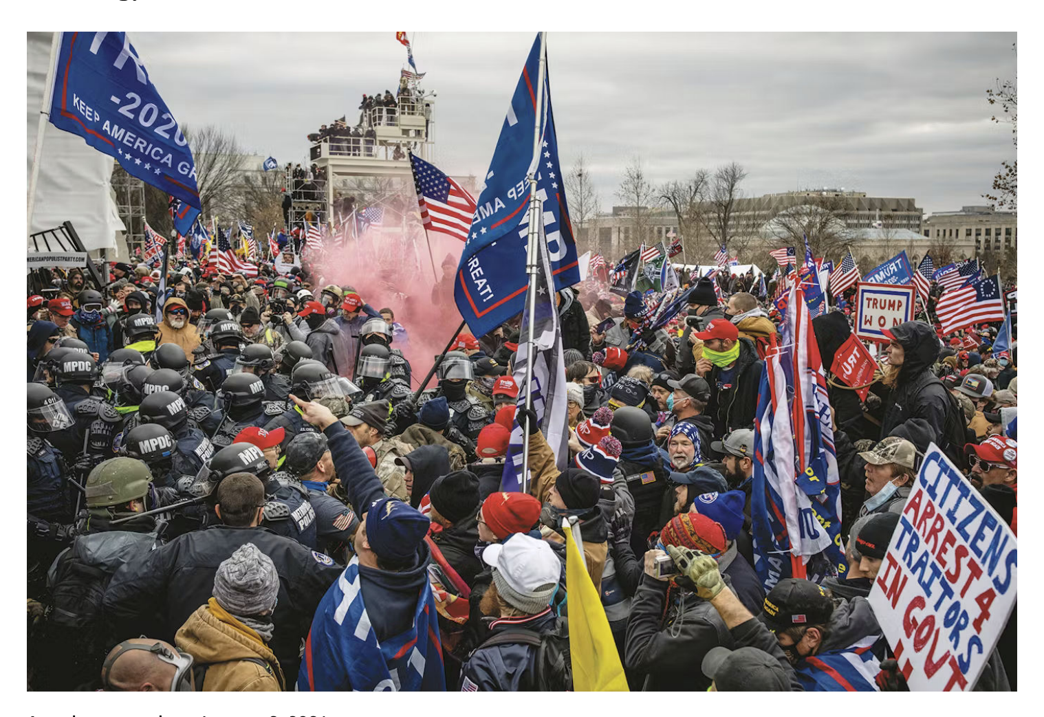
American terrorists, January 6, 2021

managing the crises of Covid and the ensuing economic fallout? How else do we explain the effectiveness of Donald's strategy of race-based division? And how do we avoid acknowledging that supporting him or even accepting him meant that institutionalized racism was not only not a deal breaker, it was an effective political strategy?